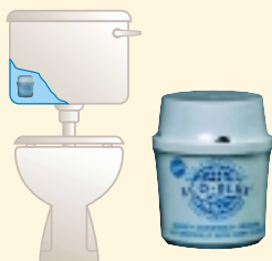
ECOBLUE Bio-enzymatic Toilet Maintainer For used in toilet bowl fixtures with water closets. Industrial strength formulation and is good for 1500 flushes with at least 2-3 months for most usage.