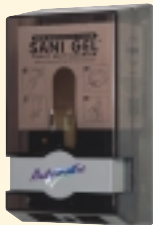
SANIGEL Toilet Seat Wipes Assured clean and dry toilet seats. Practical concept combined automatic sensor and manual operation.