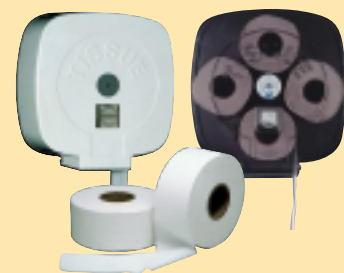
Multi-Roll Tissue Dispenser Interchangeable normal roll or jumbo roll use. Secure, robust design.