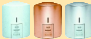
ECOBATH Corner Recess Soap Dispenser All-in-one convenient, high quality hair and body wash product. Using 600ml refillable or disposable cartridge system.