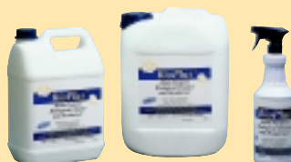
BIOPLUS Biological Cleaner & Deodoriser An economical, quick acting multi-functional products. BioPlus is the perfect solution for drain clogs, grease trap maintenance and for controlling the toughest industrial odour problems.