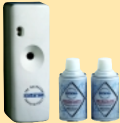
AUTOSPRAY Metered Aerosol System Metered aerosols for air sanitizing, odour neutralizer and insect control. Fully programmable spray interval with daily start/stop time settings.