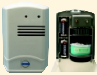
AUTOFRESH Organic Air Freshener Fan-operation Air Dispenser with 5 minutes intermittent ON/OFF switch and auto-light sensor. Uses safe natural organic fragrances.