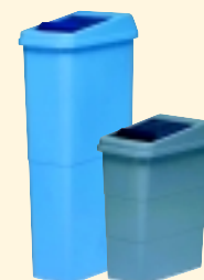
LADYBIN Sanitary Disposal Bin Slim design. Allows discrete, hygienic napkin disposal. Available Pedal operation model and Min-bin for daily self-servicing.