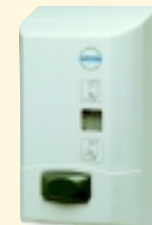
SOAP DISPENSER Practical, durable and user-friendly design. Senior or manual models using 1 litre refillable or disposable cartridge system.