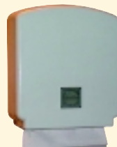
PAPER TOWEL DISPENSER Inexpensive and most convenient hand drying method compared to linen roll towel and paper roll towel. Designed to use interfold or multifold paper towels.